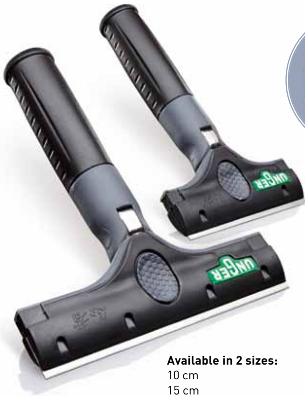
Available in 2 sizes: 10 cm 15 cm

and 30°. The scraper fits on telescopic poles for safe cleaning at height and locks securely on the ErgoTec® Locking Cone . Put simply, the new addition to Unger ErgoTec® Ninja family is the most advanced scraper for professional window cleaners.