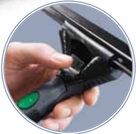
TriLoc channel locking mechanism