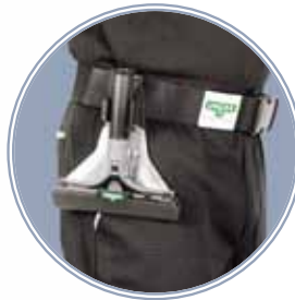
Practical Holster for the Belt